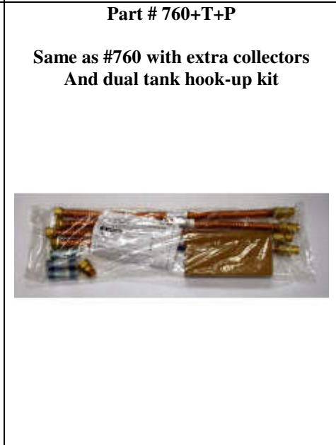
Part # 760+T+P

Same as #760 with extra collectors And dual tank hook-up kit