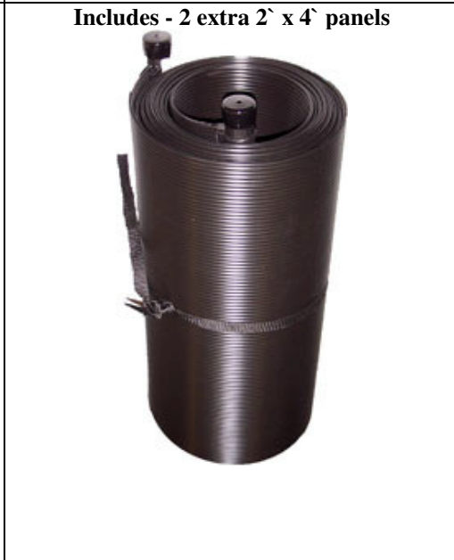
Includes - 2 extra 2' x 4' panels

Same as #760 with extra collectors And dual tank hook-up kit